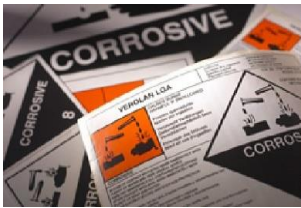
CHEMICAL PRODUCTS SYMBOLS